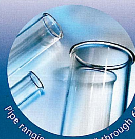
Pipe ranging from 1 1/2" through 6"