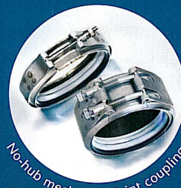
No-hub mechanical joint couplings