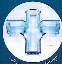
Full assortment of fittings