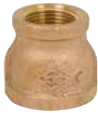
Fig. 36RC1 – Reducing Coupling