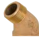
Fig. 36SF1 – 45° Street Elbow