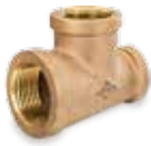
Fig. 36RT1 – Reducing Tee