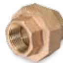
Fig. 36U 1 – Union