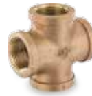
Fig. 36X 1 – Cross