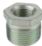
Fig. 23HB Hex Bushing Galv.