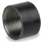
Fig. 23HC Merchant Half Coupling Black