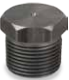
Fig. 23HP Hex Head Plug Black