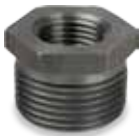
Fig. 23HB Hex Bushing Black