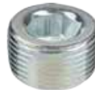
Fig. 23CH Countersunk Hex Plug Galv.