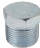
Fig. 23HP Hex Head Plug Galv.