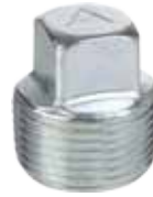
Fig. 24SP – Square Head Plug Galv.